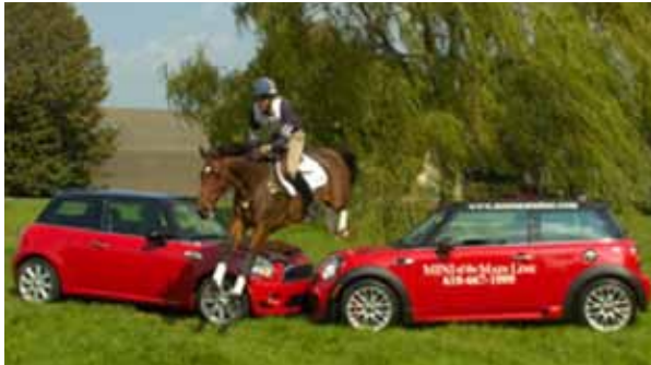
The 2008 Horse Trials were presented by Mini of the Main Line.

A United States Eventing Association sanctioned competition, divisions will be offered at the Novice, Training and Preliminary-Training levels.